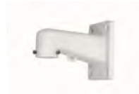
DH-PFB305W Wall mount bracket