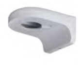
DH-PFB204W Wall mount bracket